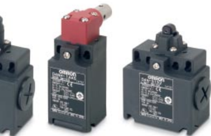
D4NH Shaft switch

This guard-lock safety-door switch is designed for interlocking applications where a slim profile is required. It offers an impressive holding force of 1000N to provide exceptional safety on doors.