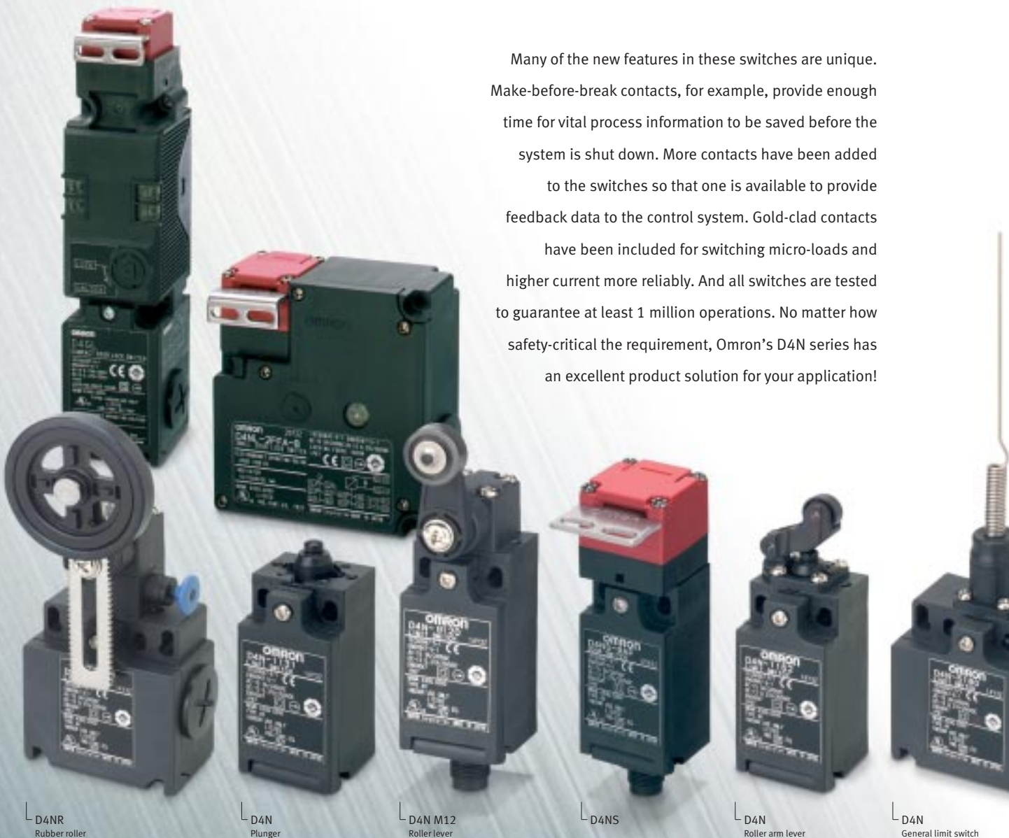
L D4NR Rubber roller

Many of the new features in these switches are unique. Make-before-break contacts, for example, provide enough time for vital process information to be saved before the system is shut down. More contacts have been added to the switches so that one is available to provide feedback data to the control system. Gold-clad contacts have been included for switching micro-loads and higher current more reliably. And all switches are tested to guarantee at least 1 million operations. No matter how safety-critical the requirement, Omron's D4N series has an excellent product solution for your application!